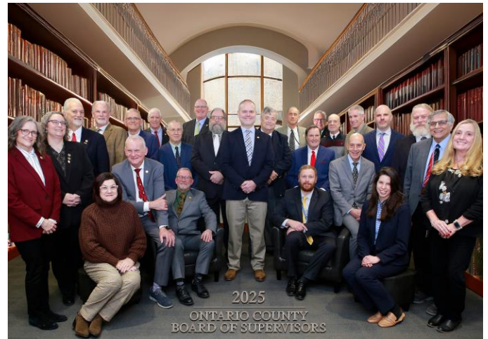
2025 Ontario County Board of Supervisors

As always, my office door is always open for questions that you might have. Phone 315-986-8100 ext. 2 or email pingalsbe@farmingtonny.org